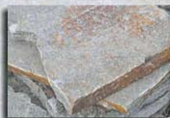
Gold Rush ( 90 - 100 S/F Per Ton )