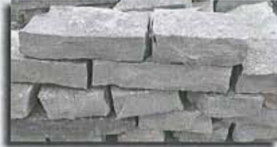
Chilton Cut Wall ( 20 S/F Per Ton )