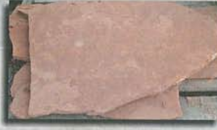
Arizona Flag Sedona Red Flag ( 80 - 90 S/F Per Ton )