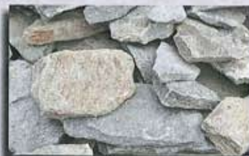
Carderock Garden Wall ( 16 - 18 S/F Per Ton )