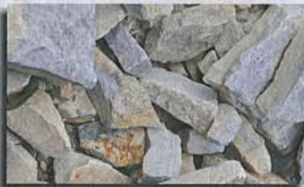
Web Wall ( 35 - 40 S/F Per Ton )