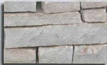
Cedar Creek Sandstone Wall ( 20 S/F Per Ton )