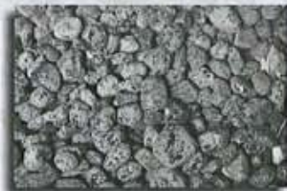
Black Marble Rock Cover