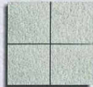
Blue Shot Blast Basalt 16x16, 16x24