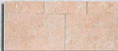
Beige Travertine 16x16, 16x24