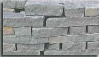
Gray Gorge Cut Wall ( 20 S/F Per Ton )