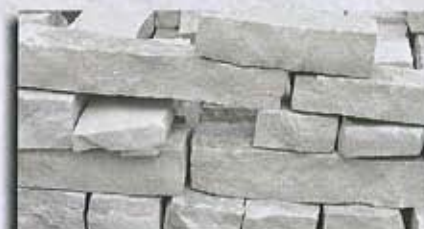
Fondulac Select Wall