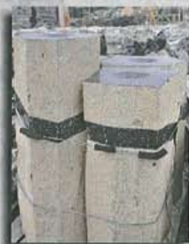
Large Basalt Columns