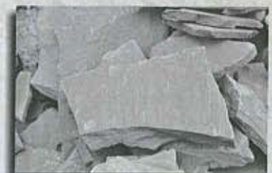
Colonial Lilac ( 100 - 120 S/F Per Ton )