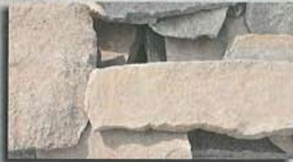
Buff Thin Veneer ( Sold By S/F )