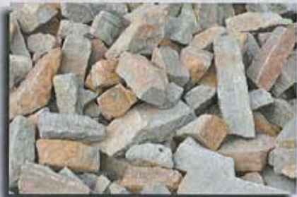
Rustic Buff Splits ( 40 S/F Per Ton )