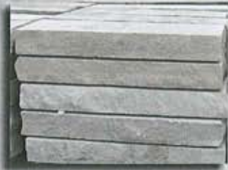
Limestone Snapped Step Tread ( 3 - 4 - 5' )