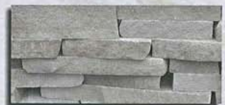
Limestone Garden Wall ( 20 S/F Per Ton )