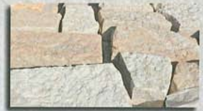
Rustic Buff Cut Wall ( 20 S/F Per Ton )