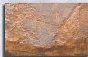
Indian Paint ( 90 - 100 S/F Per Ton )