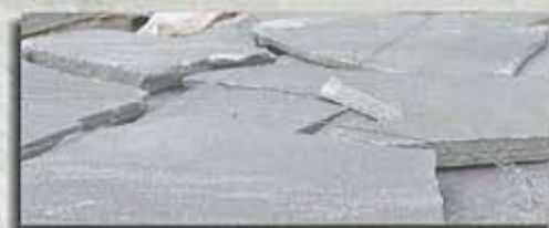
Tennessee Blue ( 100 - 110 S/F Per Ton )