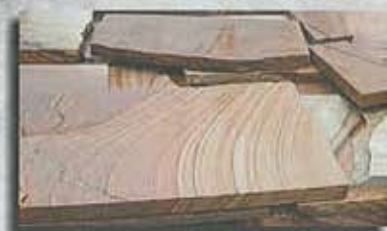
Crabapple Standup ( 100 - 110 S/F Per Ton )