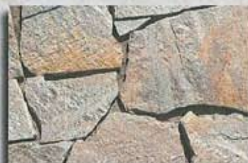
Cowboy Coffee ( 90 - 100 S/F Per Ton )