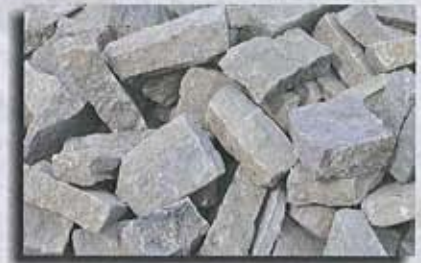
Buff Blue Splits ( 40 S/F Per Ton )