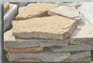
Rustic Buff Large Flagging ( 70 - 80 S/F Per Ton )