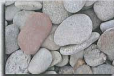
Skippers ( 80 - 120 S/F Per Ton )