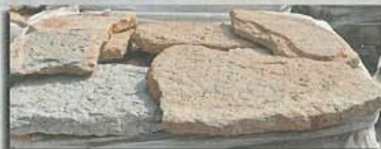
Southern Buff Large Flagging ( 70 - 80 S/F Per Ton )