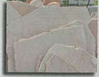
Arizona Flag Southwest Rosa ( 80 - 90 S/F Per Ton )