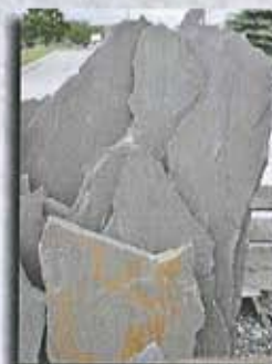
Lilac Standup ( 80 - 90 S/F Per Ton )