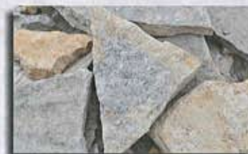
Buff Blue Featherstone ( 70 - 80 S/F Per Ton )