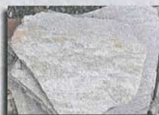
Silver Streak ( 90 - 100 S/F Per Ton )