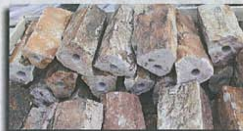
Columns Drilled or not Drilled