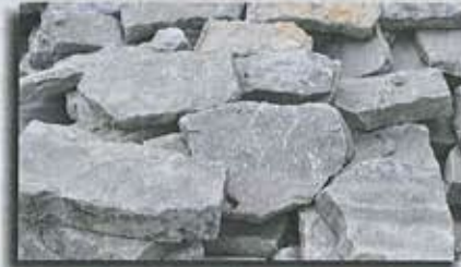
Blue Thin Veneer ( Sold By S/F )