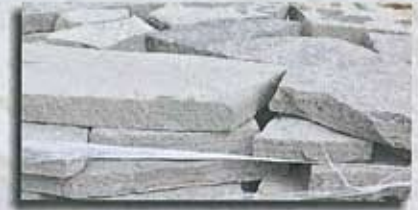
Gray Gorge Select Wall ( 16 - 18 S/F Per Ton )