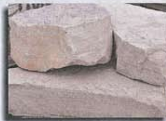
Canyon Tan Chunks