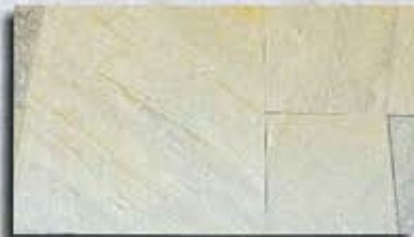
Quartz Golden White 12x12, 12x24, 24x24, 24x36