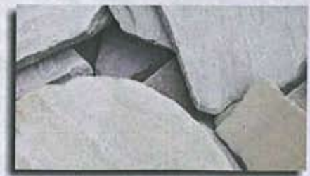
Lilac Steppers ( 70 - 80 S/F Per Ton )