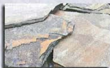
Tennessee Brown ( 70 - 80 S/F Per Ton )