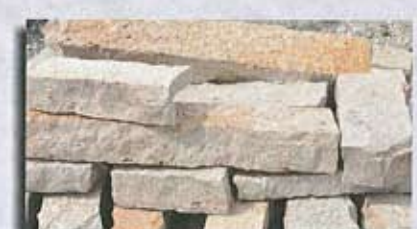
Oakfield Select Wall