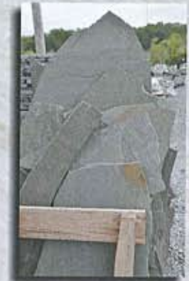
Full Color Standup Flag ( 80 - 90 S/F Per Ton )