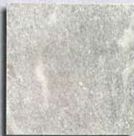
Atlantic Blue 16x16, 16x24