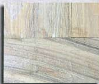
Rainbow Teakwood 12x12, 12x24, 24x24, 24x36