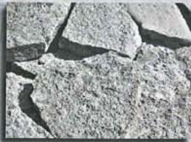
Oakfield Steppers ( 70 - 80 S/F Per Ton )