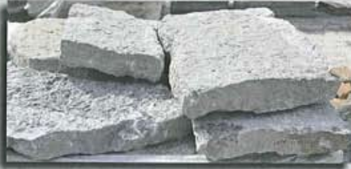
Canyon Gray Large Flagging ( 70 - 80 S/F Per Ton )