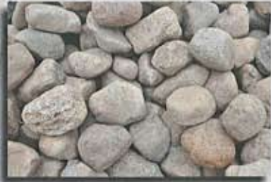
River Jacks ( 50 - 60 S/F Per Ton )