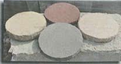
12" Asst. Steppers