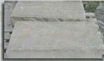
Sebastian Step Treads ( 3 - 4' )