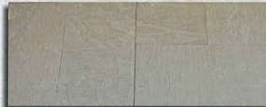
Autumn Brown 12x12, 12x24, 24x24, 24x36