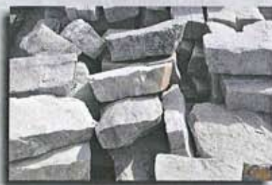
Blue Splits ( 40 S/F Per Ton )