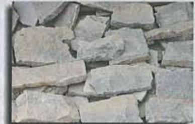
Buff / Blue Thin Veneer ( Sold By S/F )