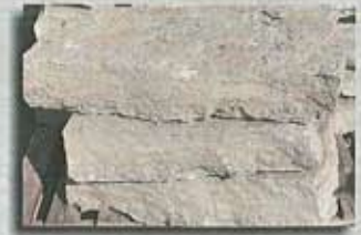
Canyon Gray Treads ( 3 - 4' )