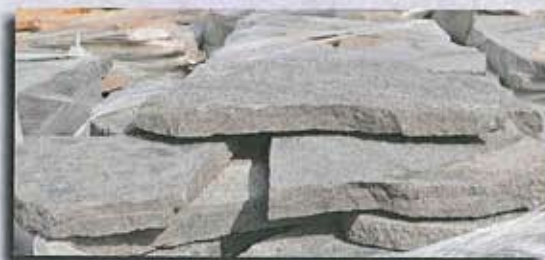
Gray Gorge Large Flagging ( 70 - 80 S/F Per Ton )