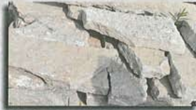
Canyon Gray Cut Wall ( 20 S/F Per Ton )