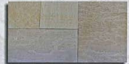
Desert Gray 12x12, 12x24, 24x24, 24x36