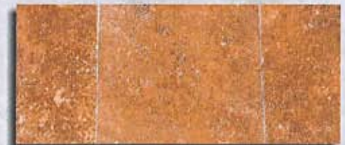
Riviera Travertine 16x16, 16x24