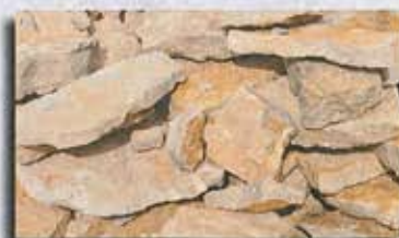
Buff Featherstone ( 70 - 80 S/F Per Ton )