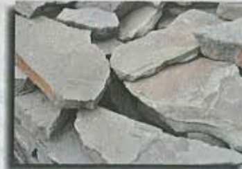
Colonial Full Color ( 100 - 110 S/F Per Ton )