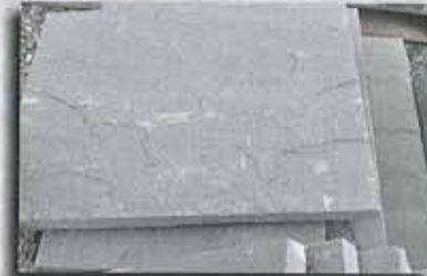
Full Color Natural Cleft Pattern ( Lilac Also Available, Also in Thermal. Sized to Order )