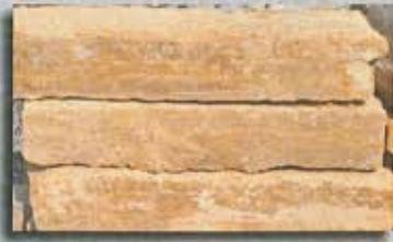
Rustic Buff Split Step Treads ( Natural Treads 3 - 4' )