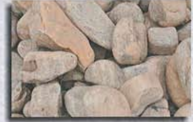
Tennessee Cobbles ( 50 - 60 S/F Per Ton )