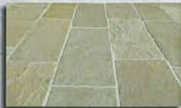
Raj Green 12x12, 12x24, 24x24, 24x36