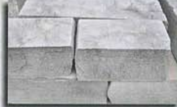
Amherst Gray Wall ( 20 S/F Per Ton )