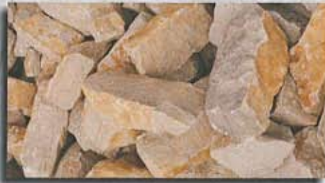
Buff Splits ( 40 S/F Per Ton )