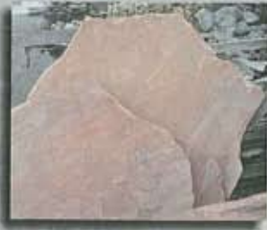
Arizona Flag Rosa ( 80 - 90 S/F Per Ton )