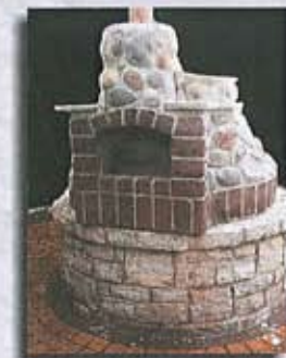
Pizza Oven Kits