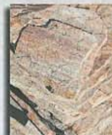
Sockeye ( 90 - 100 S/F Per Ton )